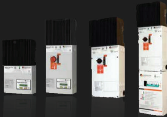
Standard, DB, TR, and TR with GFDP versions shown with optional display meters